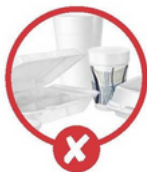
Polystyrene (Belongs in the waste bin)