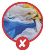
Soft (scrunchable) Plastics (Belong in the waste bin)