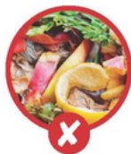
Food scraps (Belong in the waste bin)