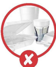
Polystyrene (Belongs in the waste bin)