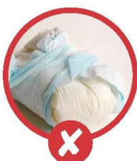
Nappies (Belong in the waste bin)