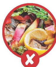
Food scraps (Belong in the waste bin)