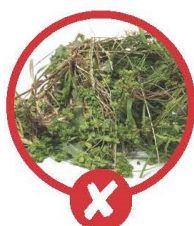
Green waste (Belongs in the waste bin)