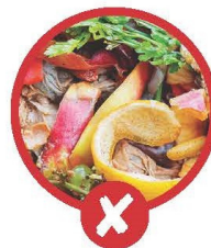
Food scraps (Belongs in the waste bin)