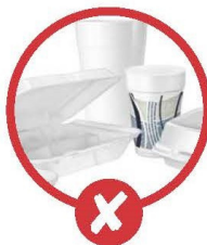
Polystyrene (Belongs in the waste bin)