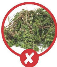
Green waste (Belongs in the waste bin)