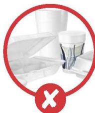
Polystyrene (Belongs in the waste bin)