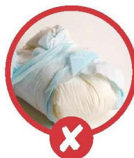
Nappies (Belong in the waste bin)