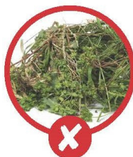
Green waste (Belongs in the waste bin)