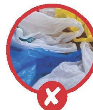
Soft (scrunchable) Plastics (Belong in the waste bin)