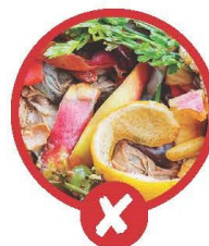
Food scraps (Belong in the waste bin)