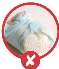
Nappies (Belong in the waste bin)