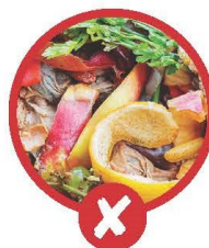
Food scraps (Belong in the waste bin)